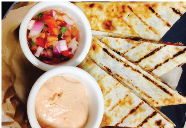
"House Smoked BBQ Brisket Quesadilla"

Southwest queso sauce, pico de gallo, jalapeños and sour cream